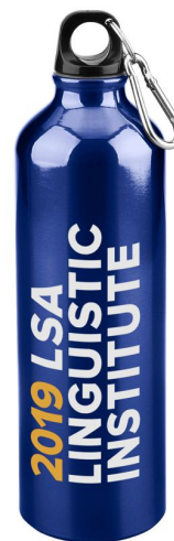
Water bottle ($16)

24 oz single wall stainless steel water bottle with threaded lid. BPA free