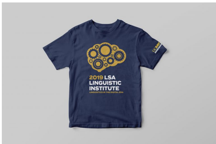
Cotton t-shirt ($25)

Remember the 2019 LSA Institute with some merch!